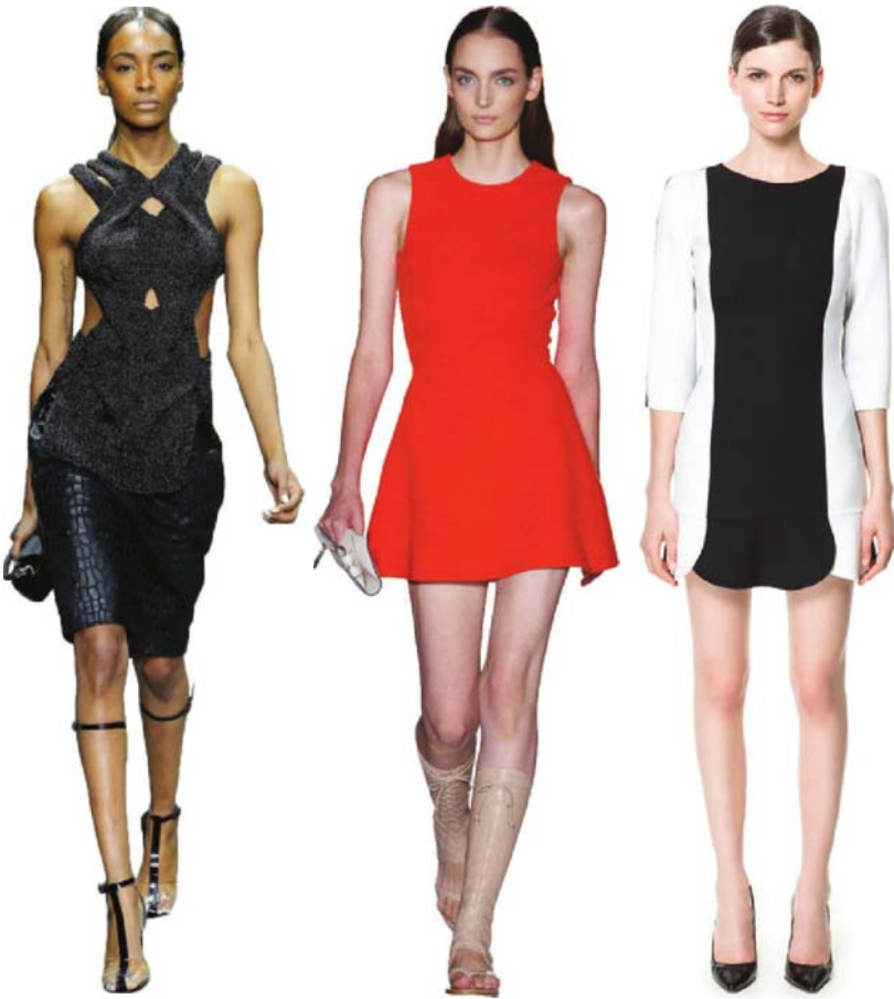
Cutouts featured at Alexander Wang's spring show.