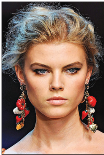
Make a bold statement with oversized earrings, as seen at Dolce & Gabbana.

at Michael Kors, the focus was all on safaris — his collection of earthy sandals strapped up the calf looked fit for an expedition in the wild. The key to a good tribal-inspired piece is multiple textures and vibrant patterns.