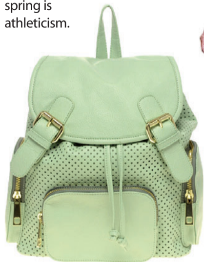
Functional and fashionable, the backpack is back.

Another big theme for designers this spring is athleticism.