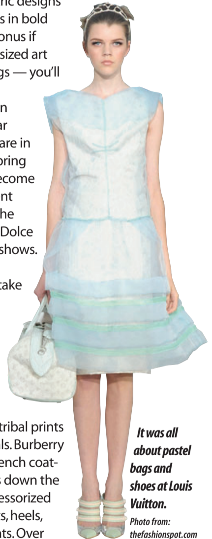
It was all about pastel bags and shoes at Louis Vuitton.

For those wanting to take on a bolder style as the weather starts to warm up, look for accessories inspired by tribal prints and materials. Burberry sent their trench coat-clad models down the catwalk accessorized in tribal belts, heels, bags and hats. Over