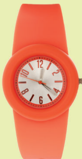
Go sporty with a bright, rubber timepiece.